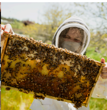
The latest buzz